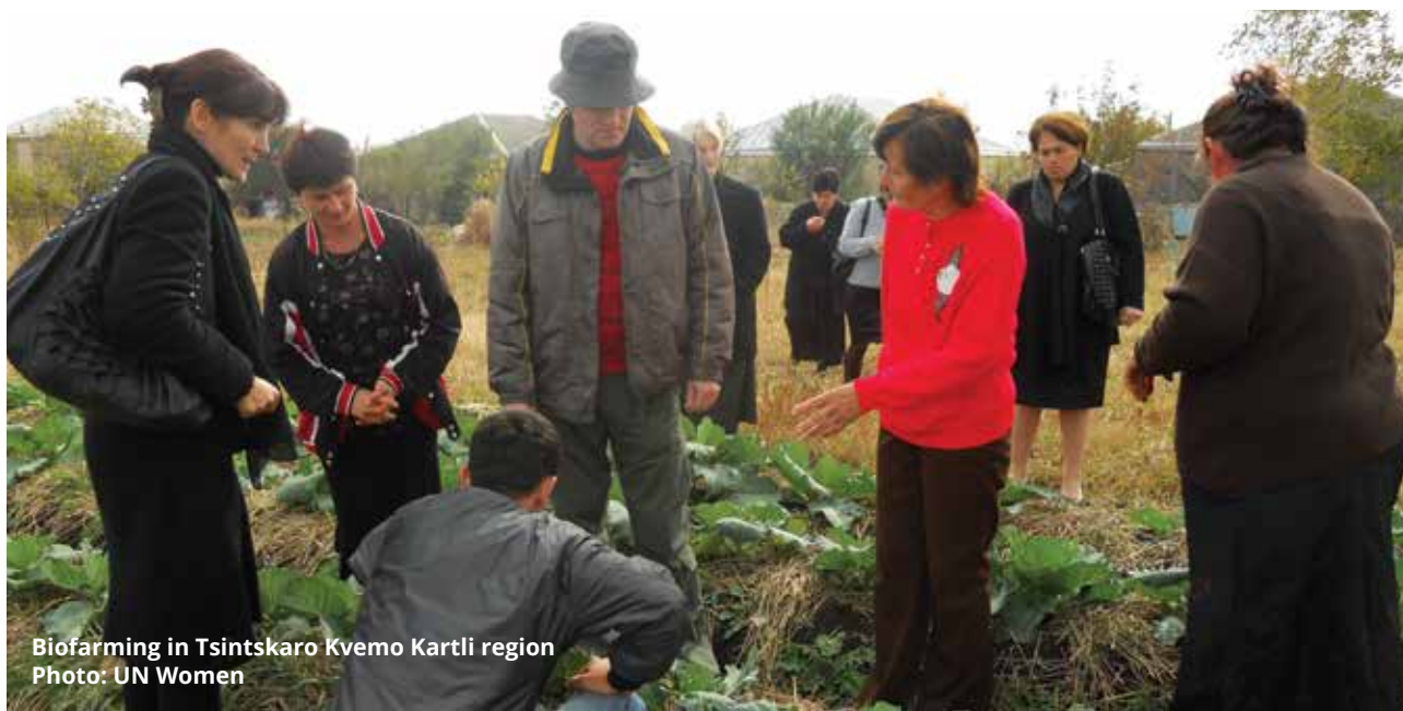
Biofarming in Tsitskaro Kvemo Kartli region

Frequently, the women among the WEPD target populations are wholly unacquainted with the fact that they can play an active role in improving their lives and the lives of others around them. This is where UN Women and the efforts of their partner organizations played an important role over the past five years.