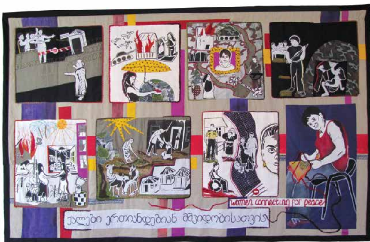
Peace quilt sewn by IDP and conflict-affected women

It was exactly this holistic approach – one that employed multiple strategies and directions – that would later be instrumental in achieving many of the project's stated objectives, and result in the desired changes that the WEDP initiative sought to accomplish over the course of the five-year period.