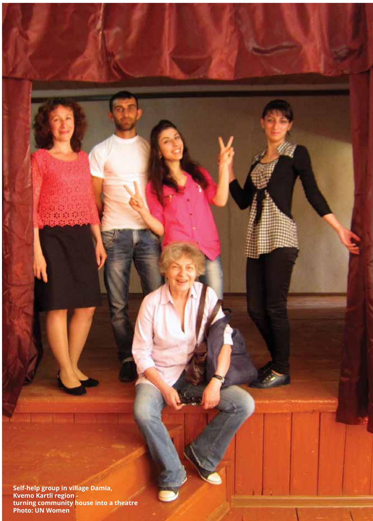
Self-help group in village Damia, Kvemo Kartli region - turning community house into a theatre