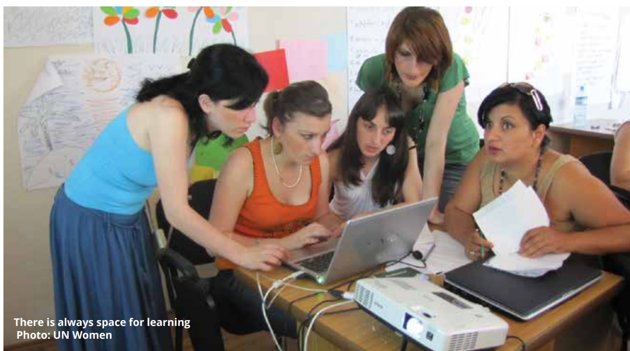
There is always space for learning