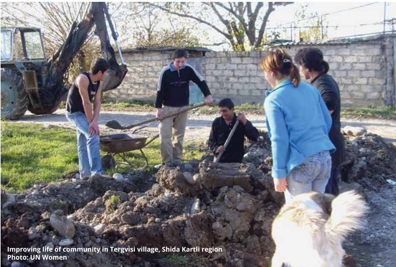
Improving life of community in Tergvisi village, Shida Kartli region